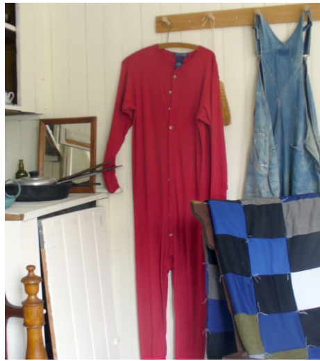
Current Interior photos of Sammy's Cabin, the kitchen has an iron sink, water pail and ice tongs.