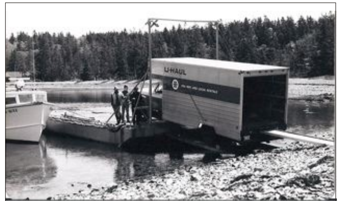
Gordon Shaw's photo, "Unloading the kit cabin at Preble Cove." This photo was taken about 1980.