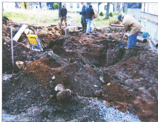
Placing support columns for the deck