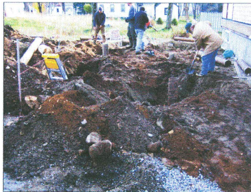
Placing support columns for the deck