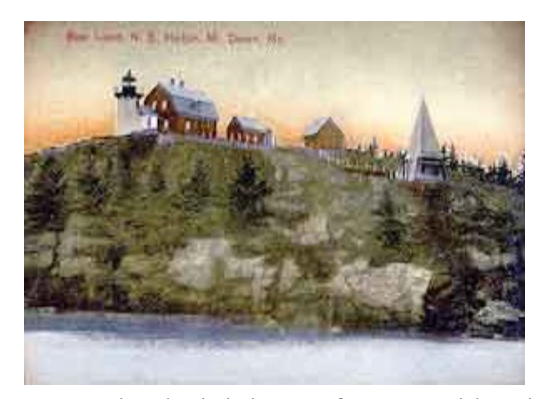
Bear Island Lighthouse from an old Robbins Bros. (Boston) post card. ("Place postage stamp here: domestic 1 cent, foreign 2 cents")

The lighthouse is currently inoperative, and serves as a private residence. See the June 2000 issue of the magazine Architectural Digest (page 122) for an article about the current occupants' restoration of the lighthouse.