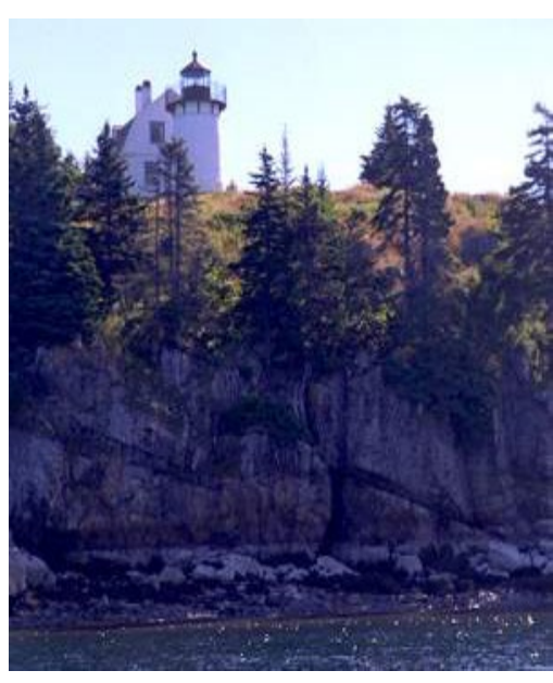
Bear Island Lighthouse today.