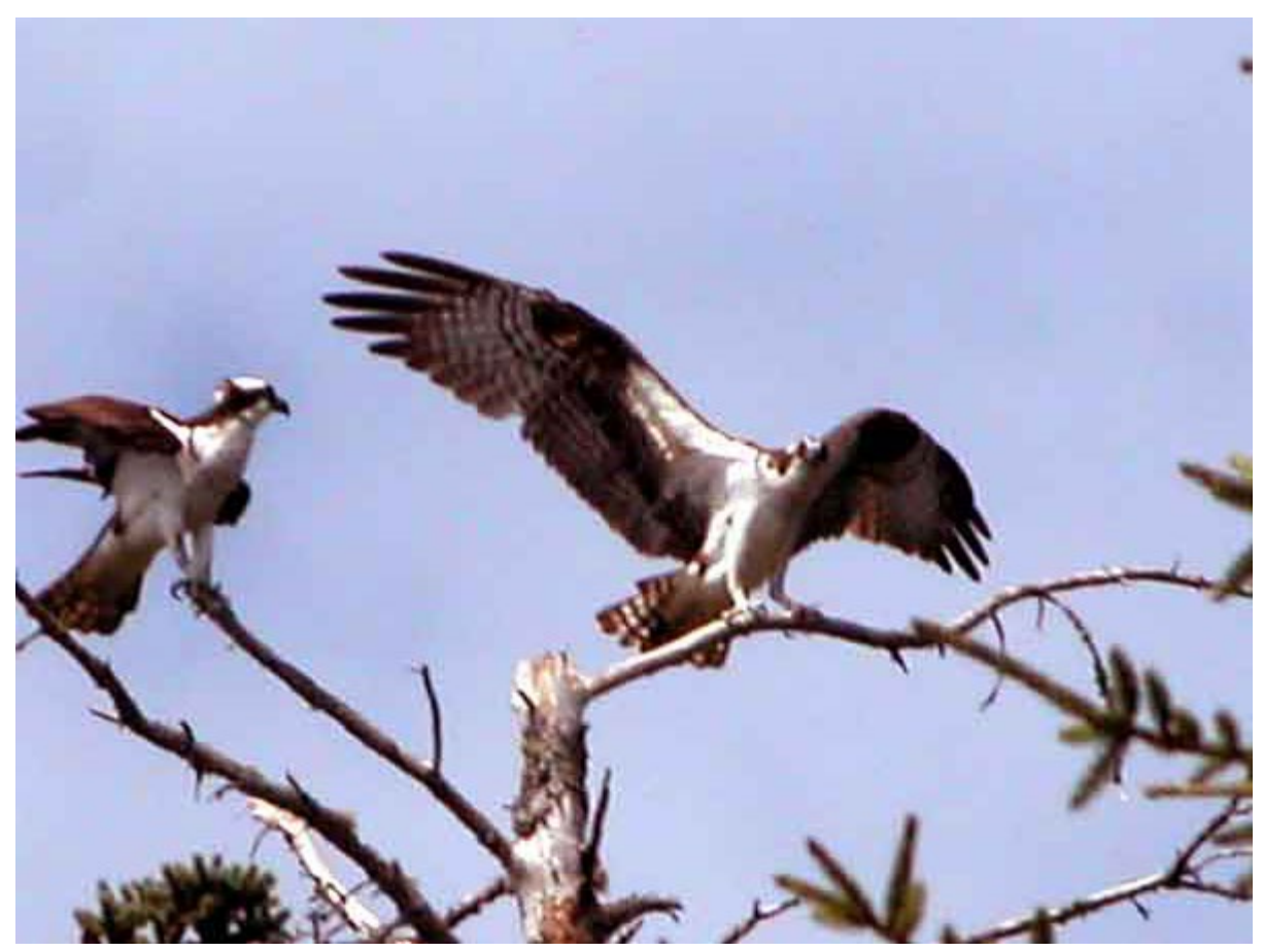
Ospreys on Bear Island