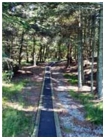
then up the hill along the wheelbarrow ramp...