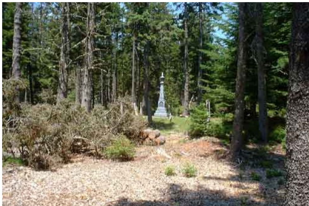
until you glimpse the obelisk off to the left.

The Sutton Island Cemetery is a small plot situated in the middle of the island. When you land at the Town Dock, follow the boardwalk path straight back over the beach stones, through the grass field, up the hill via