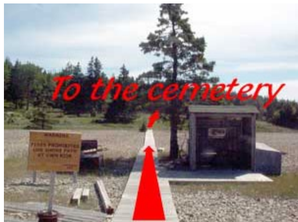
Path to the cemetery is straight back from the Town Dock,

Compiled Summer 2000 by Bruce Komusin Great Cranberry Island Historical Society