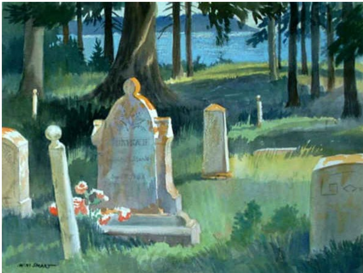
Watercolor with pastel touches, copyright © Wini Smart

Compiled by Bruce Komusin Great Cranberry Island Historical Society 15 July 1999